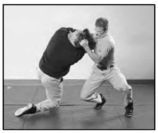
After training in the SCARS System, a smaller person truly can defend himself against a larger, stronger opponent.

The Institute is a spec-ops bou deals with armed forces, military professionals, the security staff c corporations and even South Arr their bodyguards.