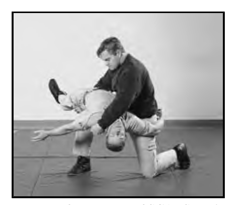
Because of the nature of SCARS Institute clients, quick and effective techniques such as this back breaker are the focus of the self-defense training.