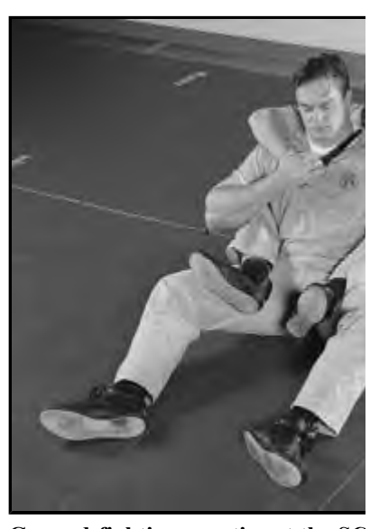
Ground-fighting practice at the SC includes an often-neglected elemen

"This is why defensive fighting systems cannot win against SCARS, Peterson told us. Diagrams on the blackboard indicated that direct offensive action is always quicker through the nervous system than the stop-and-catch-up reactions of a defender. "SCARS is literally faster than any other kind of fighting," he said.